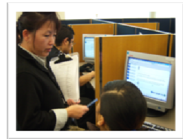
Haas Media associate assisting with Hmong translations for Milwaukee County.