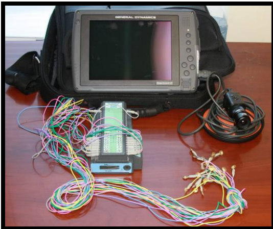
Portable EEG Monitoring Equipment

Neurotech broke even in about 1 ½ years, which is very good for a start up business, and is now financially solid. At the time of this writing (January 2009), Neurotech is 3 years old and has nine employees and has added a Chicago office in addition to the original location in Milwaukee. Last year the Neurotech business doubled, and he is very optimistic for the future, even considering some very tough economic times.